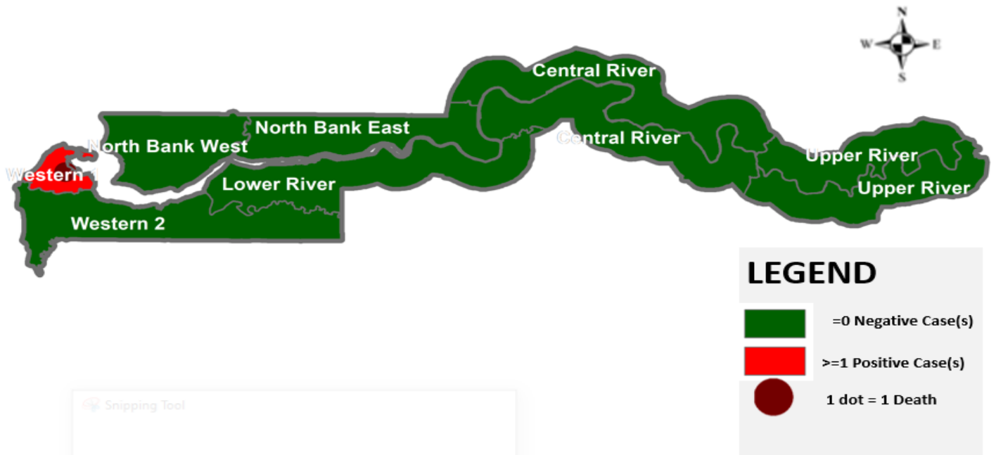
Fig 2: Map of The Gambia showing COVID-19 affected region