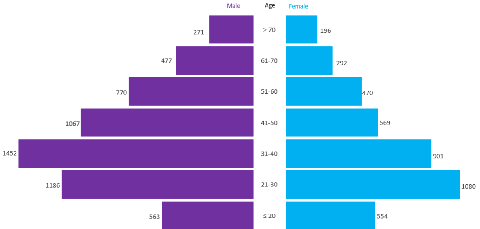
Fig 2: Age-Sex Distribution of Confirmed COVID-19 Cases, The Gambia, 2021

✧ This excludes the 27 confirmed cases whose demographic information are not yet available